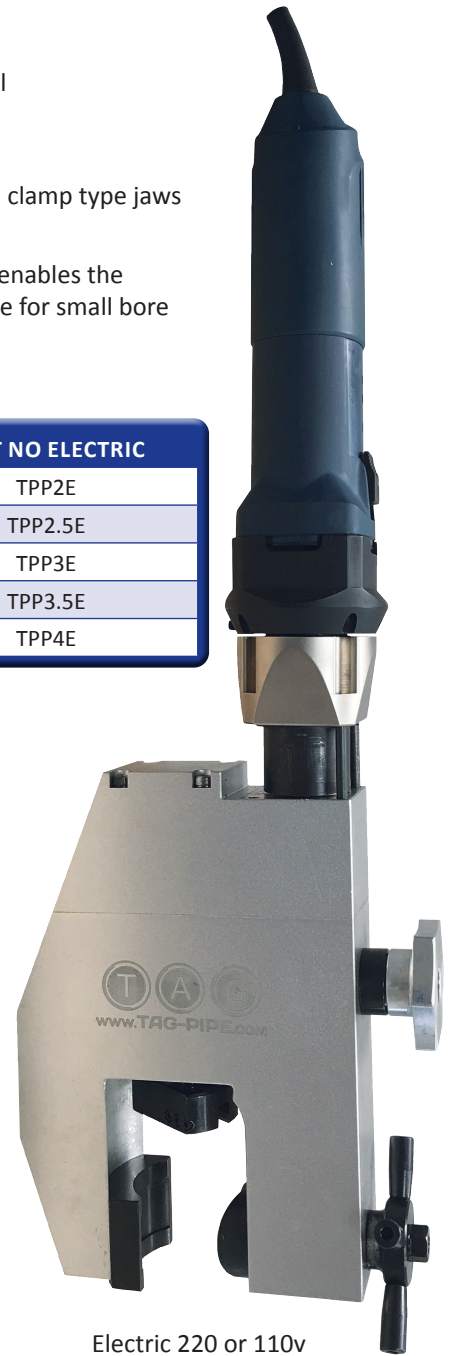
Electric 220 or 110v